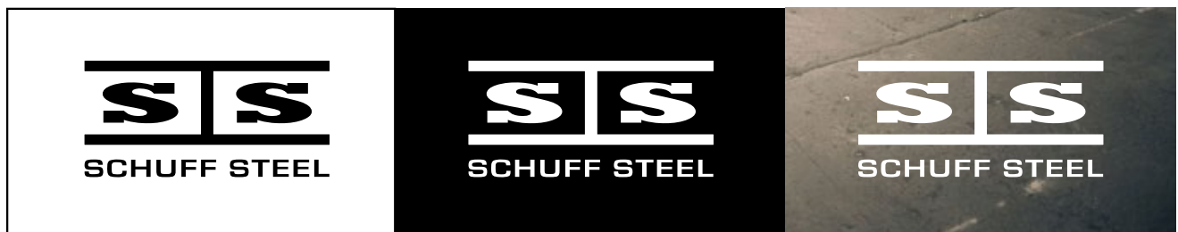
Primary logo on white background

On a white background, always use the primary logo. If the background of your application doesn't allow the primary logo to be legible, you may opt for the white reversed Schuff Steel logo.